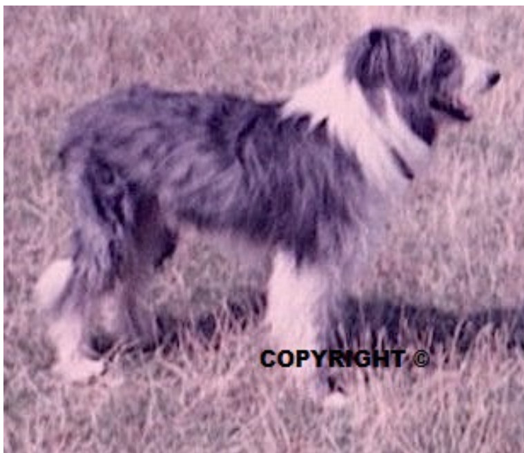
Turnbull's Blue (1978)