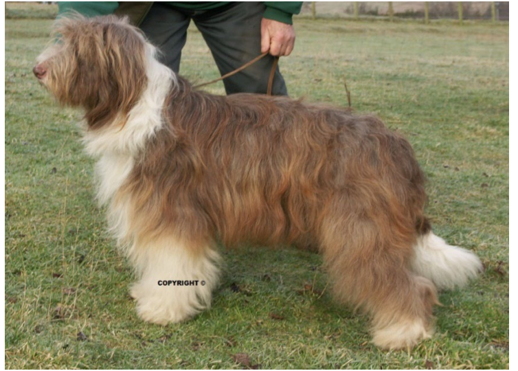
[Sallen] Holly (unreg; 2007, healthy at age 14)