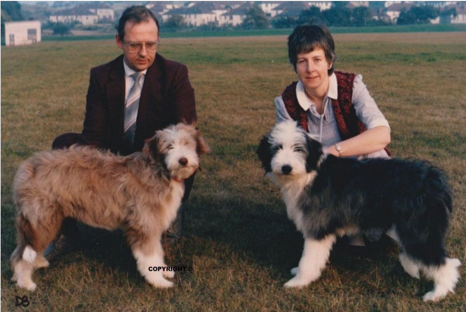
Sallen Fern & Sallen Lass (1987, littermate sisters by Turnbull's Blue X Sallen Clover Honey)