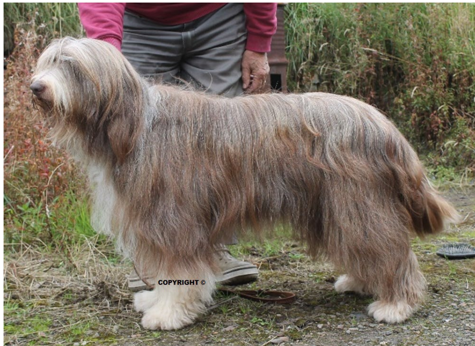
Sallen Ruby (healthy at age 13)