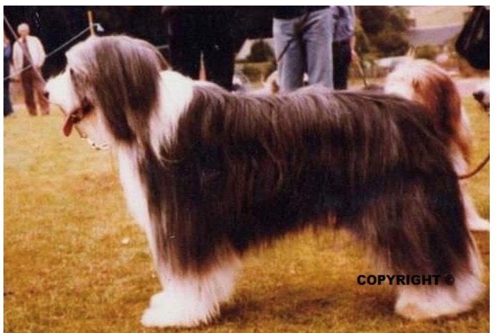
Sallen Barley (1977, 1 CC, 2 res CC)