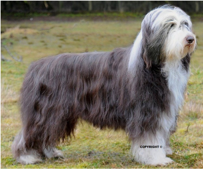
Sallen Harrar (2003)