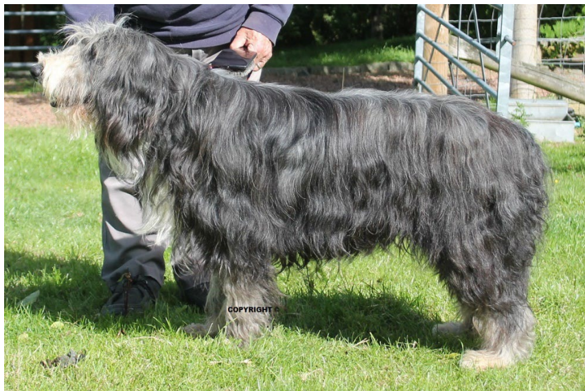
Sallen Csar (2017. S Carrigallen x S Sofija)