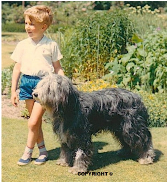
Bredon Whisper (1964)