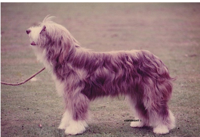
Sallen Deborah (1970, 1 CC, 2 res CC)

Of my own breeding, the animals I regard as among the best I have bred are Sallen Zadok, S. Barley, S. Deborah, S. Calla, S. Harrar and his sister S. Java, S. Ruby, and Holly (unregistered but with a daughter registered in France). S. Carrigallen is probably the best stud dog I have bred or had, together with Craftsman of Sallen and S. Harrar.