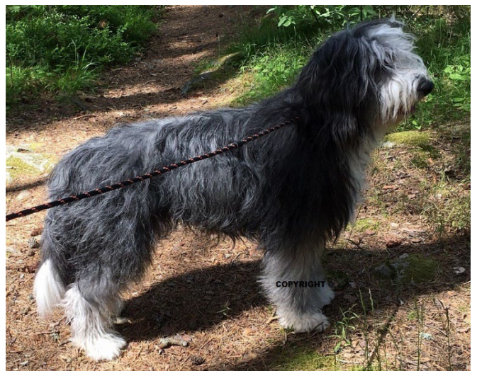
Sallen Duke (2020, S Csar x S Rockrose)