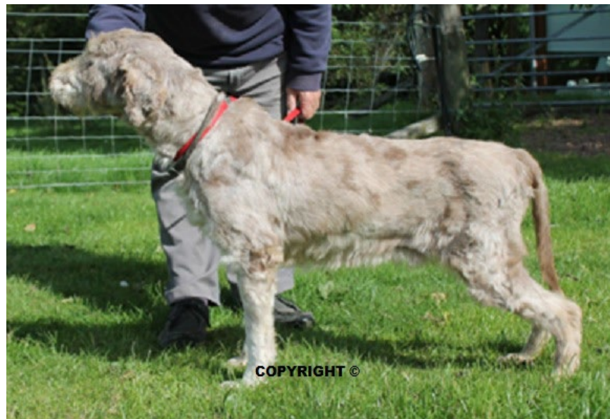
Sallen Carrigallen (2006, S Cava x S Gail; photo age 14, healthy at 16)