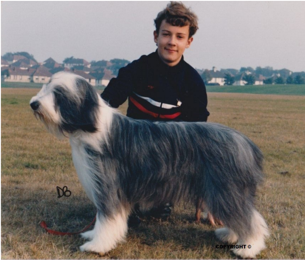
Craftsman of Sallen (1984)