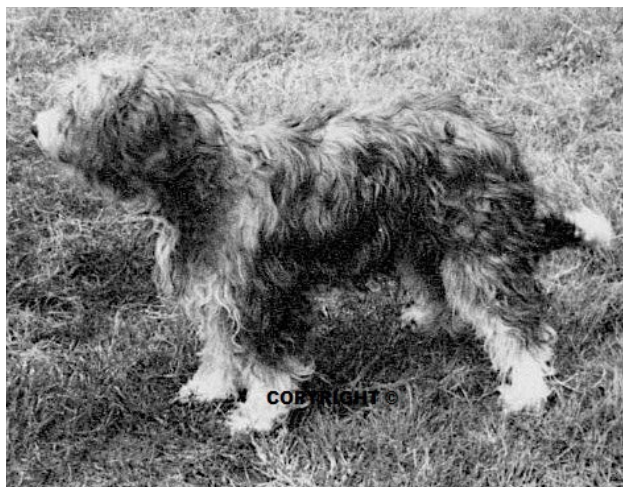
Bredon Mist (1959, dam of Whisper and Quarry)