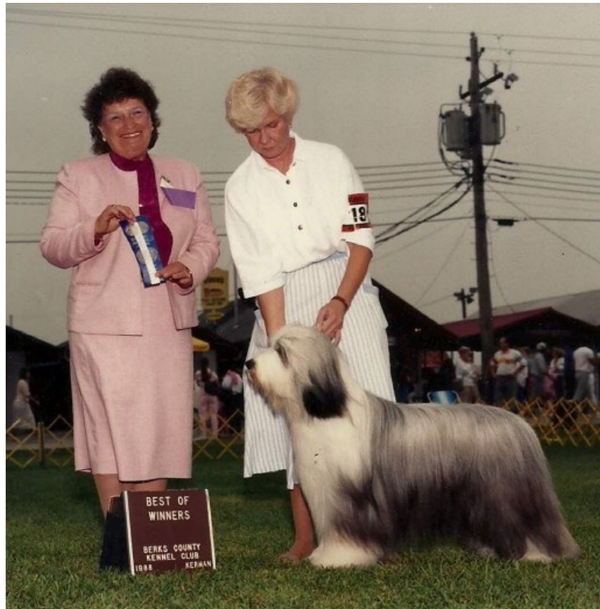
AM.CAN.CH. POTTERDALE PROSPERITY

Some of the dogs I have judged over the years have impressed me with their beauty and sheer ease of movement - so fundamental for the breed we love. Here are just a few: