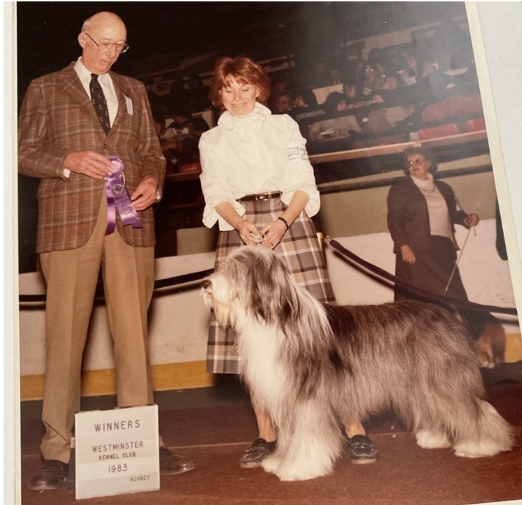
Dovmar's New Man About Town