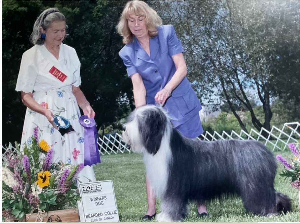
Dovmar's New Man Will Dew It