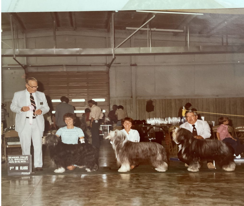
CH Graelyn Bonnie from Robdave (front) Am Can CH Blue Gatling of Dovmar (middle)