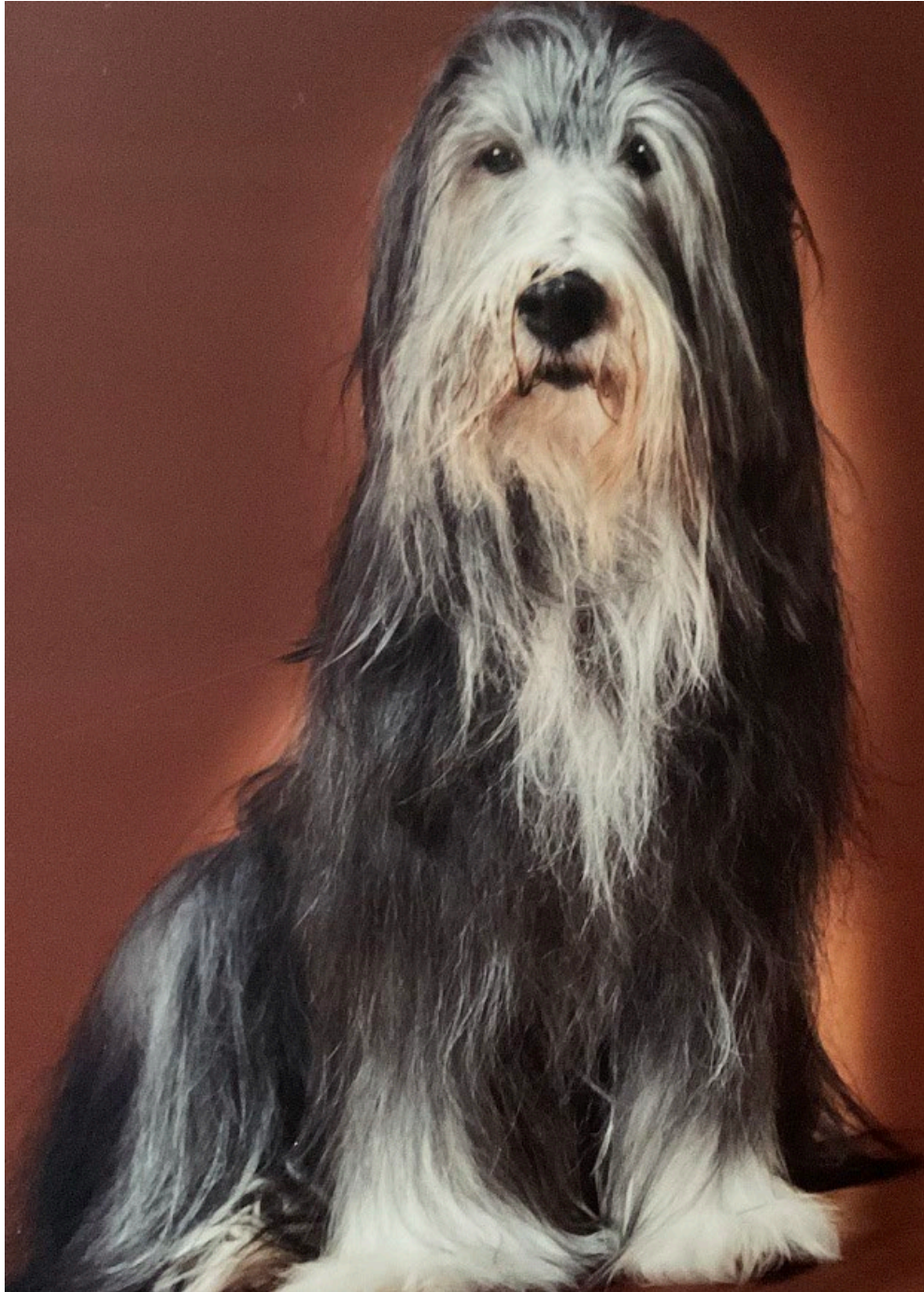
Bonnie, CH Graelyn Bonnie from Robdave

Should the use of stud dogs be controlled? I think that would be hard to control. We are all trying to better the breed and if there is one dog that a lot of breeders feel that can better their lines then they would want to use him. I think it would be up to the owner of the stud dog if they felt he was being used to much.