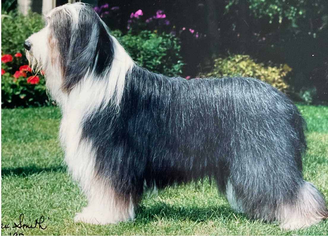
Dovmar's New Man on the Move