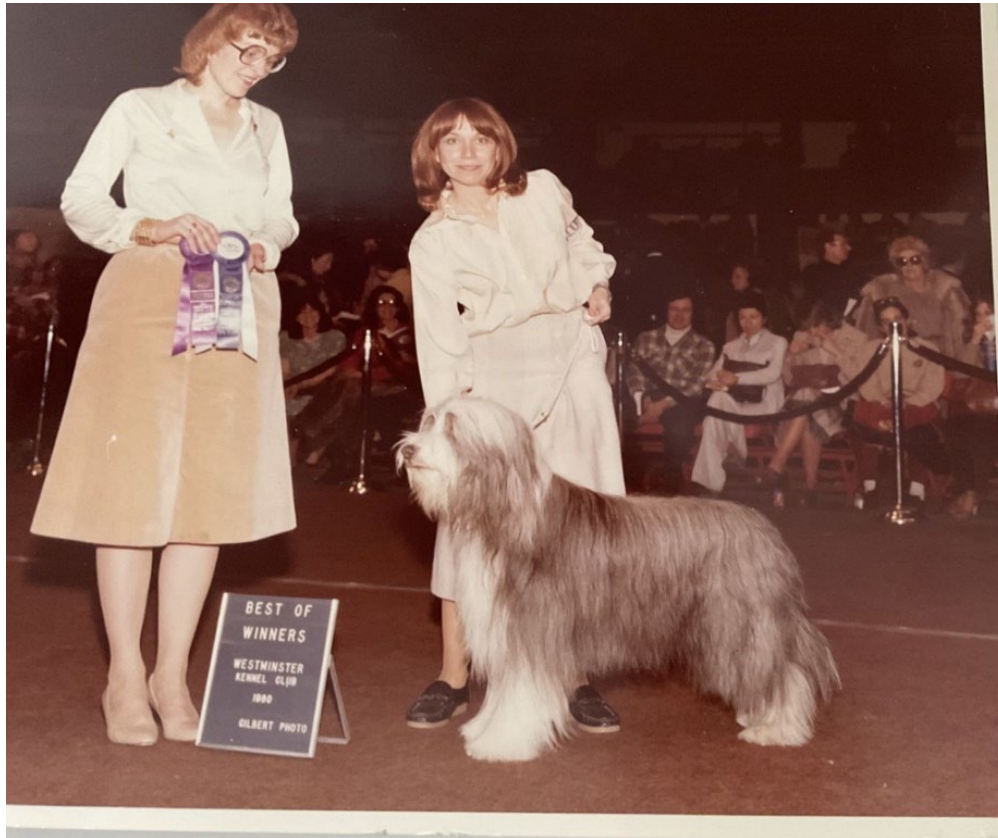
Am Can CH Blue Gatlin of Dovmar