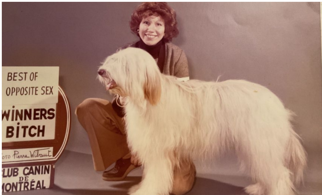
Sandy de Lauvrin